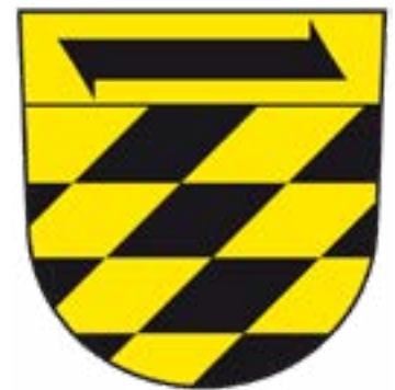
Coat of arms of Oberndorf.

This year, we made an additional effort to take a meaningful step toward reconciliation: we invited the mayor of Oberndorf to the commemoration of 80 years of freedom. It was a historic moment on September 14, when, for